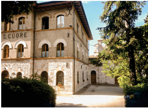
ENTRANCE TO THE OASI DEL SACRO CUORE Viale Vittorio Emanuele II, n°5