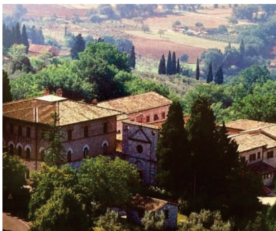
OASI DEL SACRO CUORE - ASSISI (PG), Italy Viale Vittorio Emanuele II, n°5